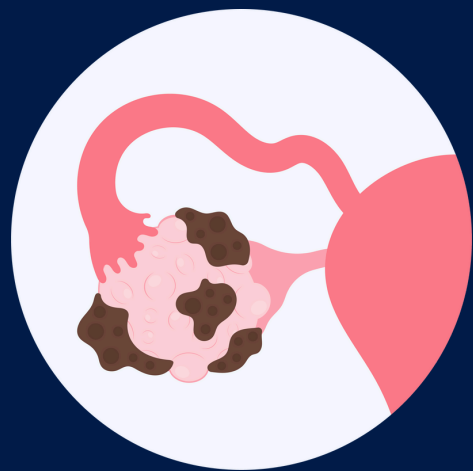
Polycystic ovary syndrome (PCOS)