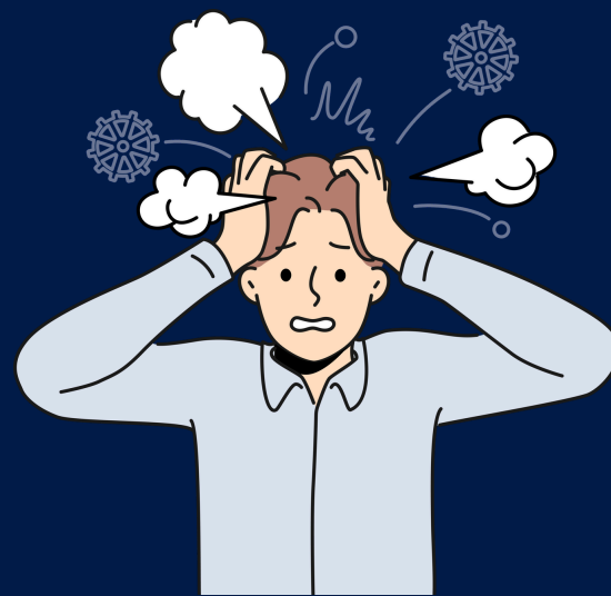
Stress and Anxiety