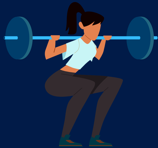
Muscular Strength & Endurance

I advocate for a holistic view of wellness that transcends mere physicality. It involves mental clarity, emotional equilibrium, and a cohesive bond with our bodies. This is why I prioritize the five components of fitness.